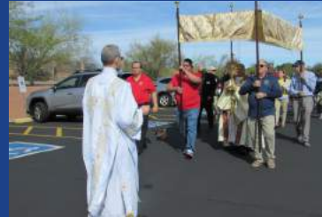
Thank you members of the Color Corps for your participation in our procession.