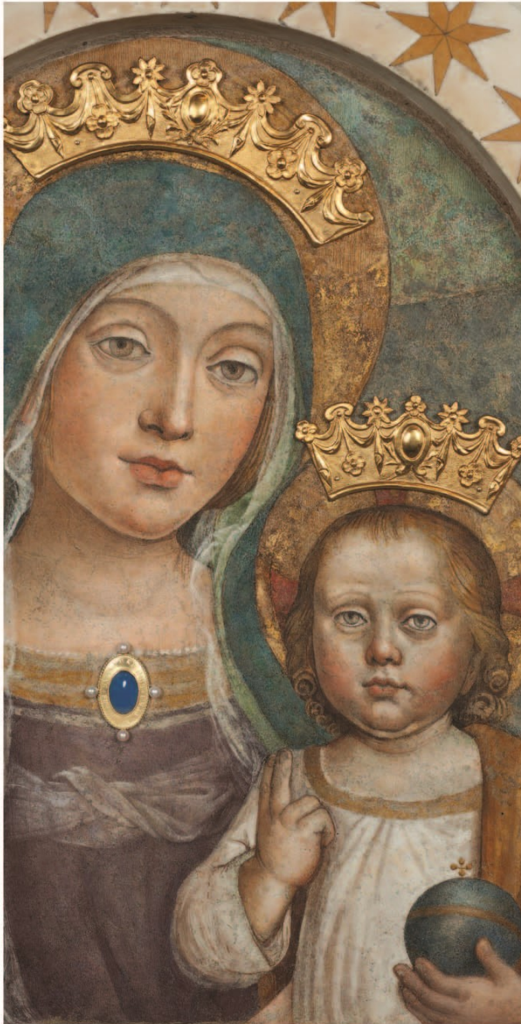
The ancient fresco of Madonna del Soccorso (Our Lady of Help) in St. Peter's Basilica was restored with the support of the Knights of Columbus to mark the Year of Faith (2012-2013).

O Mary, you always brighten our path as a sign of salvation and of hope. We entrust ourselves to you, Health of the Sick, who, at the Cross, took part in Jesus' pain while remaining steadfast in faith.